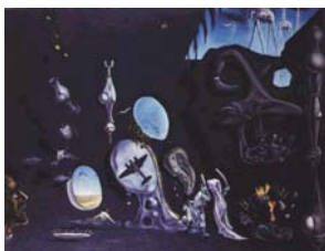
Fig.1 Atomica Melancholica

He incorporated some physical knowledge into his artworks calling this style Nuclear Mysticism. 3 In one of his interviews Dali claims that "nothing is more sexual than collision and explosion of nuclear inter- atomic conflicts." He also speaks in an interview on nuclear mysticism. Dalí said that at different stages of his life was focused on radical studies that were contemporary then. Below we will present some works which show that Dalí is partly disconnected from oneiric (of or relating to dreams or dreaming) of Sigmund Freud thinking through closely the problems that were bothering many European countries. The artwork (fig1) below appears mostly in dark colors which indicate a condition which does not coincide with a dream or with a momentum but with a grim condition into which is included a period of wars, bombings and loss of people. In the portrait in front, instead of eyes, nose and lips is placed a plane which shows moreover the bombing, portrait on the left shows the suffering, realistic portrait, wrinkled and open mouth demonstrates again a condition that was not at all oneiric or mystical but a reality (some claim that this portrait demonstrates the fear of Dalí himself, although the portrait doesn't have any similarity with Dalí himself) between human creature and destruction of the atomic bomb. We can see the egg and circles as well which show the atomic globules which were chain to achieve the goal of bombing.