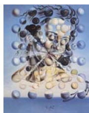
Fig.2 Galatea of the Spheres