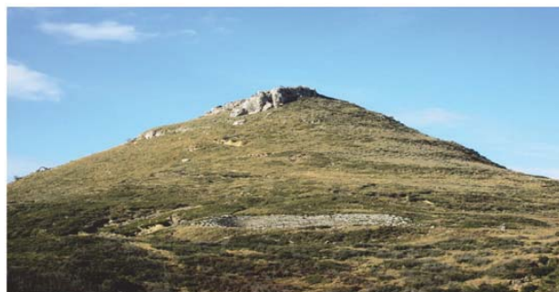
Figure 4. panoramic view of Amantia hill