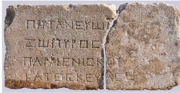
Figure 5. Inscription, E. Sina (2015)