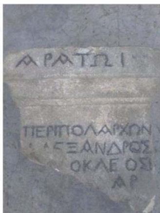
Figure 8.a. Inscription form (A.Trushaj)

In the east of the city of Amanties was built an ancient castle that today is in the present Matohasanaj village. Its construction provided amant koinoni protection on that side where regular garrisons of soldiers were stationed specifically under the direction of military commander or peripolarc. An incomplete inscription found on the wall of the castle talking about it.