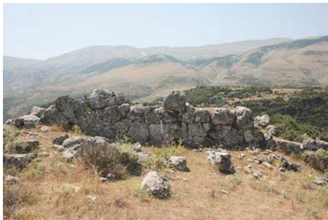
Figure 8.b. Matohasanaj region (A. Trushaj)