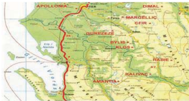
Figure 2. Geographic map of Apollonia – Byllis region – Amantia (C.A.A.)

This position makes Amantia an important crossroads in trade relations between the south coast of Illyria and interior regions. City with an area of 20 hectares is situated on an isolated rock plateau ( figure. 3-4), which stands at a height of 613 meters north-west of Mount Tartarean. He has a perimeter wall of my 2100 equipped with three monumental gates.