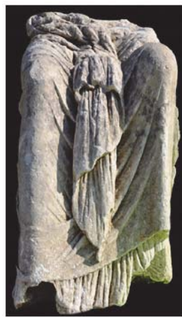
Figure 6. The statue seen in front (E. Sina)