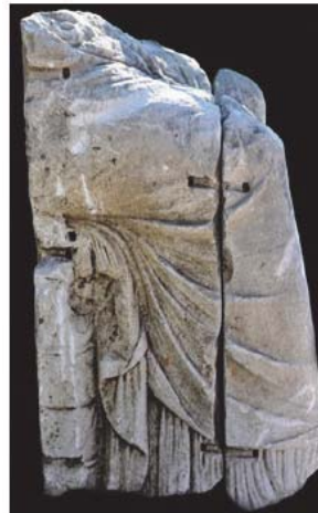
Figure 7. The statue seen on the left (E. Sina)

Another inscription comes from the eastern periphery of the amant territory.