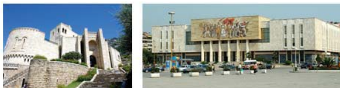
Historical Muzeum “Gj. K. Skënderbeu”, Kruja National Historical Museum, Tirana

The other tourism hotels in the country, although were built with good capacities, seldom were used for tourists. Clapsed in the morse of isolation, they were visited more from the native travelers than from the few tourists that passed the Albanian border. Most of them, because of the economical downfall, could not be optimally utilized in their full capabilities. Also voluminously and architectonically, the major part of them are not distinguished for authentic values, being proposed unanimously with a significant verticality, aiming to dominate the squares, following the example of the “fifteen storeys building” in the capital. Anyway, together with the palaces of culture, they would absorb the maximal engagement of the architects and urbanists, as the new stylistic language of the urban centers. In fact, Hoxha's state, until the end of the '80s would succeed in totally transforming most of the Albanian cities. The huge building blocks, at times elegant and at times with minimal costs (prefabricated structures), were the definition and the habitat of the new Albanian Man. The residence buildings always came into existence along with health centers, schools, playgrounds, sporting fields and parks.