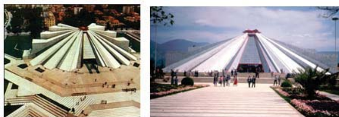
"Enver Hoxha" Historical Museum, Tirana

Being projected in the family, by the couple of architects, Hoxha's daughter, Pranvera and Klement Kolaneci, her husband, the building is clearly different from any other building of the after-war period (Grosi, 2008: 19). It is proposed as a new geometric definition of the eagle, but being seen as such only from above, while from the viewpoint of the passer-by is evidently similar to an Egyptian pyramid which has opened its "wings".