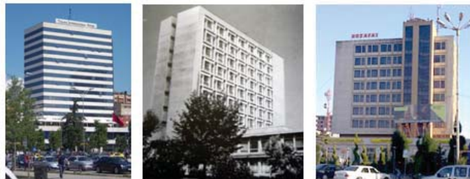
Hotel Tirana, reconstructed Tourism Hotel, Elbasan, (V. Pistoli) Tourism Hotel, Shkodër (A. Lufi)

The other tourism hotels in the country, although were built with good capacities, seldom were used for tourists. Clapsed in the morse of isolation, they were visited more from the native travelers than from the few tourists that passed the Albanian border. Most of them, because of the economical downfall, could not be optimally utilized in their full capabilities. Also voluminously and architectonically, the major part of them are not distinguished for authentic values, being proposed unanimously with a significant verticality, aiming to dominate the squares, following the example of the “fifteen storeys building” in the capital. Anyway, together with the palaces of culture, they would absorb the maximal engagement of the architects and urbanists, as the new stylistic language of the urban centers. In fact, Hoxha's state, until the end of the '80s would succeed in totally transforming most of the Albanian cities. The huge building blocks, at times elegant and at times with minimal costs (prefabricated structures), were the definition and the habitat of the new Albanian Man. The residence buildings always came into existence along with health centers, schools, playgrounds, sporting fields and parks.