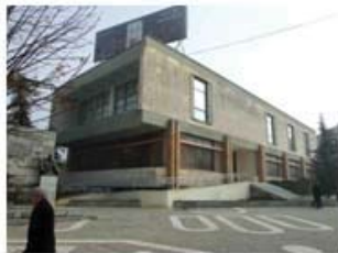
Korça's Library, P. Kolevica

Shinasi Dragoti writing at the press of the time would emphasize that at these projects were visible the improper influences of the modernist architecture. The cine-theater in Fier, which was rightfully criticized for its unattractive shape, gave the impression of a being similar to a church, like the ones that were built in capitalist countries and were advertised from the bourgeois-revisionist propaganda. But there were also other foreign tendencies, which appeared in some buildings where there were walls without any window. According to him, these were pseudo-esthetic conceptions, which had their source at the harmful influence of the modernist architecture (Dragoti, 1974: 81). Also, Alfred Uçi, the selected esthete of the regime, some years later would emphasize that from the discussions that were made, it was admitted unanimously from our healthy artistic opinion that the shapes of the Cine-theatre in Fier, the Korça's Library, the ATSH building, were an expression of the influence of the formalist influence... they were created contrary to the healthy tastes of our socialist society (Uçi, 1977: 45). The "formalist" terminology was mentioned often in order to imply the inclination of certain visual artists during their persecution, and was naturally used as an official term for the condemnation of the "underlined" architects.