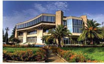
The Palace of the Congresses, Tirana

But beyond the aspect of the urban organization, the state was attentive also to the near and far past. As a consequence, was undertaken the edification of some major structures (with a lot of economical efforts), dignified to reflect the glorious history of the Albanian people. The top of this request for identity would be without doubt the National Historical Museum, which would be raised alongside the new hotel, giving to the Scanderbeg square a new conception and a final separation from the past. After building the Great Palace of the Culture and Hotel Tirana, the Albanian state edified the third personal building in the main square of the country, which this time was dedicated to the history. According to Faja, the state (regarding the space concept) would treat the centers of the cities as urban spaces in the function of the patriotic and revolutionary education of the working masses (Faja, 2008: 122). In order to edify this master-plan, the state was ready to sacrifice even the cultural heritage, as was the case of Tirana's Old City Hall, constructed by Italian architects, which was demolished to be replaced by the National Historical Museum.