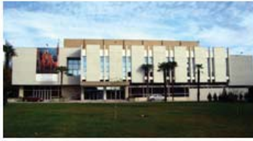
National Gallery of Fine Arts, Tirana