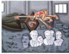
Toni Milaqi, The Dictators' Ghost Acrylic on canvas, 120x90 cm