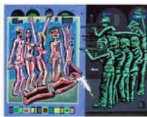
Toni Milaqui, Execution IV , 2008, acrylic on canvas, 120x90