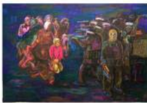
Alfred Dade, Execution , oil, 250x300 cm 1984

Albanian political silence occurred parallel to the political speaking and generated the phenomenon of 'unexpressed silence' in art. It manifested itself as 'painting in shadow' before 1990, and as politically speaking painting after the transition. As is evidenced by different works, their aspects are attacks, defend, shoot down, executions, human massacre, mind destruction, etc. Since the messages of this politically speaking art are life-important, Milaqi needs to make sure that has got across his messages to viewers. Therefore, he repeats and re-emphasizes them in multifold versions, so increasing the possibility that people are receiving and understanding the messages in the way intended. Through repetitions of the core idea in cognizable forms, the author argues that his conception is about the tragic consequences for people.