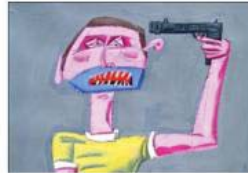
Toni Milaqi, To Be or Not to Be , detail, 2011, acrylic on paper, 70x60 cm

If we correlate Milaqi's paintings to Pema's pictures, it is obvious that the political messages of both artists emphasize the destructive impact of political rhetoric irrespective of the political system. Pictures To be or not to be and Interventions just point to the two directions of destructive forces, to others and to ourselves. If we compare the painting before and after 1990, the ambivalent representations of political rhetoric of war as ideological pro-communist heroic images, on the one hand, and images of human suffering or resentment, on the other hand, are imbued with the clear idea of the political 'silence' in communism. Winter defines: 'Silence is a space where nobody speaks what everybody knows, and it is an area which is socially regulated, socially constructed, socially preserved, and socially destroyed.' (Kalaci, 2009:34).