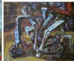
Alfred Dade, Massacre , oil, 80x100 cm

Politically speaking art makes tangible what people suffered behind the mask of the ostentatious and propaganda heroism in the official art of 'socialist realism'. It brings into prominence the cognition of that time, and shifts the focus away from the communist heroes and heroism to not less fundamentally significant idea of suffering, as a way of complementing the Albanian history through works of art. In Milaqi's Crucifixion we can recognize how even the Christian symbolic becomes an expression of a 'betrayed philosophy' (Milaqi, 2009a). For these reasons, expressed silence in 'painting in shadow' as well as in the politically speaking painting after 1990 may be comprehended as a counterpoint to the 'political silence' which Jay Winter considers.