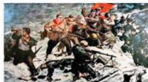
Fatmir Haxhiu, Tenda e qypit , 1969, 300x500 cm

The underlying premise here is that the official art is generally a politically speaking one. Pictures clearly and unambiguously convey ideological messages and form perceptions, thoughts, notions, and working method. Depiction of war and its perception was, due to the party line, glorious, victorious and impressive struggle. Art was used to symbolize the symbiosis of artists and audiences with the party ideology. War became a 'live forever' topic to demonstrate the heroism of communists and of the Albanian people as a soldier.