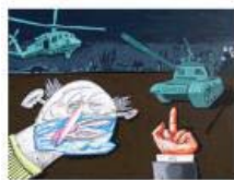
Toni Milaqui, Thinking about Imperialism and Military Expansion , Acrylic on canvas, 120x90 cm, 2011