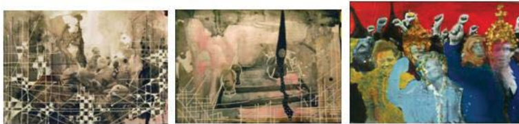
Heldi Pema. Leninism no more. Collages

Pema's collages on some of the photographs seek purposeful compositions to create abstract images which to convey critical attitude towards the political speaking in art. Under the mask of the collages, they reveal truths of the past, and impact as critical reassessment of the ruling communist ideology.