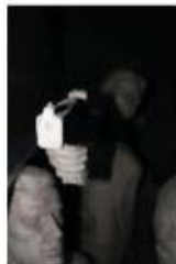
Heldi Pema. Interventions

Just one picture is named, Interventions . In the context of the entire collection it may be a title of a 'photo session' expressing the core idea of the time 'life is war' or the basic communist instrument 'political speaking as a ruling method of violence'.