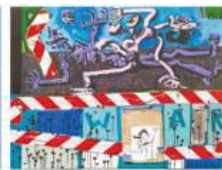
Toni Milaqui, Stop the War , 2003 cm mixed technique, 120x90 cm