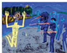
Toni Milaqui, Execution II , 1996, Acrylic on canvas, 130x100 cm

Quite the contrary to the widespread meanings of the political speaking in art of 'socialist realism' is the contemporary politically speaking painting. One of the younger artists after 1990 is Toni Milaqui, working in a conceptual manner imbued with the dramatic idea of the human suffering in 'silence'. Essentially, his pictures are expressive metaphors of criminal acts of the political power over the people. The artist (2009a) writes: ' The socialist realism period is one of the most extreme concerning the self-destroyed dynamic and impact upon the Albanian society.' The experiment of the communist doctrine and 'socialist realism', claims Milaqui, had as a result 'monsters in Albanian society formed' (2009j).