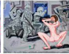
Toni Milaqi, The Rape of Liberty , 2010, acrylic on canvas, 120x90 cm