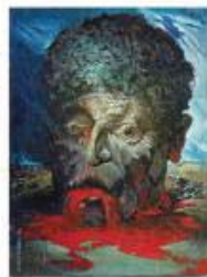
Artur Muharremi, Terror , 42x32 cm