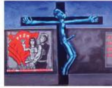
Toni Milaqi, Crucifixion , 2008, acrylic on canvas, 120x90 cm