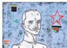
Toni Milaqui, Black , acrylic and collage on paper, 70x60 cm, 2012