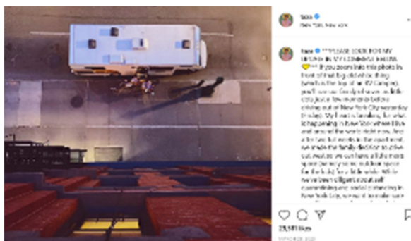
Figure 9: Naomi Navis' post about leaving New York

Yet, some microcelebrities undermined the assumption of their ‘ordinariness’ as well as the assumption of their exemplary lifestyle, the two pillars of their popularity, when they shared with their followers how they violated the lockdown restrictions. For example, Naomi Navis, a mother of five, and her husband escaped locked-down New York in an RV to keep her family's mental health and to give her children a chance to go outdoors and reported the move on Instagram (the photo of the RV is still uploaded, the text to go with the photo has been changed after the followers' backlash (Navis, 2020)) (see Fig. 9).