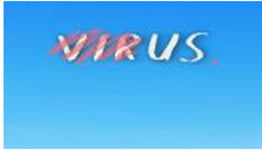
Figure 8: Sia's post