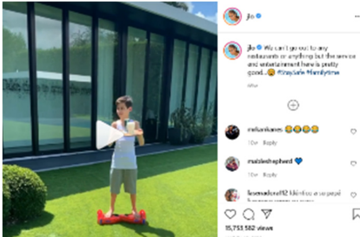
Figure 7: Jennifer Lopez' post

Online events arranged by celebrities for their audiences actualized the assurance strategy: they engaged people, distracted them from the lockdown boredom and communicated the message of celebrities' sincere involvement with their fans. Celebrities carried on working without any financial gain (for example, John Legend streamed his concert on Instagram, while Miley Cyrus launched the livestream where she interviewed other celebrities, e.g., Demi Lovato, Rita Ora, Jeremy Scott, etc.).