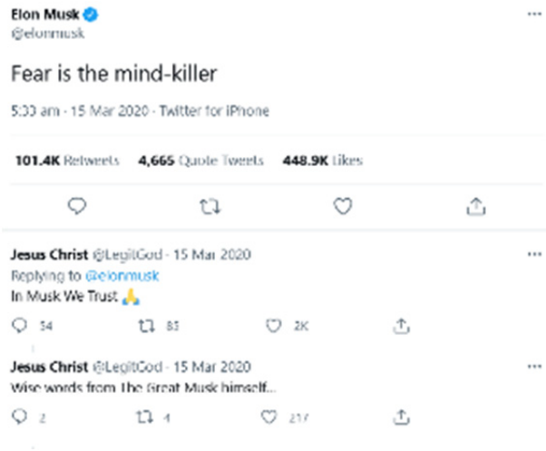
Figure 6: Elon Musk’s tweet

Vanessa Hudgens unintentionally challenged the public by taking lightly numerous victims of the coronavirus in her Instagram post on March 16. What she said was, literally, “I’m sorry, but like, it’s a virus, I get it. I respect it. But at the same time, like, even if everybody gets it, like, yeah, people are gonna die. Which is terrible, but like, inevitable?” (the video is accessible in (BBC News, 2020)). The audience was quick to denounce the attitude to human lives.