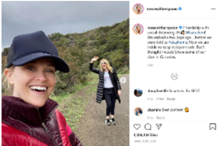
Figure 5: Reese Witherspoon's Friendship with social distancing

Entertaining and following the social distancing instructions were not the only tasks to be shared. Celebrities also reported more serious occupations and tried to get their audiences engaged by asking for their feedback. Nicole Richie, for example, posted a photo of the books she was going to read ( These are my lockdown plans. Please send me 9 thousand more recommendations. (My recommendations to you are The Great Alone, & The Hearts Invisible Furies). Also shows and movies. Just entertain me dammit! (Richie, 2020). Shakira informed her fans of the completion of a course on Ancient Philosophy and posted a photo of herself and the course certificate: I just graduated from my 4 week Ancient Philosophy course with the University of Pennsylvania (@Penn). I know... my hobbies are very impractical, but it took a lot of hours after the kids were asleep. Thank you Plato and predecessors for all the "fun" over the past month! (Shakira, 2020). These messages, besides exposing private lives and optimism, openly encouraged to follow the quarantine rules and explicitly or implicitly invited to join the celebrities in the activities.