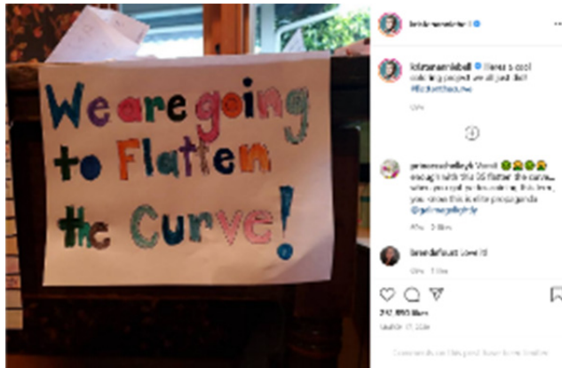
Figure 3: Kristen Bell's coloring project

Kristen Bell used Instagram to show her followers how she kept her children entertained (Heres a cool coloring project we all just did! #flattenthecurve (Bell, 2020)) (see Fig.3).