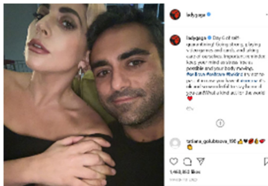
Figure 2: Lady Gaga. Day 6 (2020, March 18)

Lady Gaga posted a photo on Instagram showing herself playing video games and cards with her boyfriend Michael Polansky and adding the captions: Day 6 of self-quarantining! Going strong, playing video games and cards, and taking care of ourselves. Important reminder: keep your mind as stress free as possible and your body moving. #selflove #selfcare #bekind try not to pass it in case you have it #corona it's ok and so wonderful to stay home if you can! What a kind act for the world ❤️👍 (Lady Gaga, 2020, March 18)) (Fig.2)