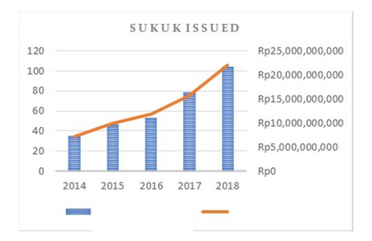
Figure 1. Sharia Compliant Bonds issuance in Indonesia

Empirical Results and Discussion Descriptive Statistic Development of the financial industry in Indonesia. The development of Sharia Compliant Bonds in Indonesia since its inception has shown a fluctuating trend. The success of investing in the Sharia Compliant Bonds at the beginning of its establishment has made the Sharia Compliant Bonds market more vibrant in the last decade. The large number of investors who believe in the type of Sharia Compliant Bonds investment and the large amount of investment issued by the issuer in the form of Sharia Compliant Bonds issuance make Sharia Compliant Bonds an attractive investment alternative to consider. Some of the factors that may have contributed to the increase in investment are thought to be developments in banking sector financing and developments in the stock market. Currently, there are 104 corporate Sharia Compliant Bonds issuances in Indonesia, issued by 22 corporate Sharia Compliant Bonds issuing companies in Indonesia. A sharp increase occurred throughout 2018, namely as much as Rp. 22 billion, an increase of almost 30% from 2017 which was only Rp. 15.7 billion and an increase of 67.5% compared to 2014 which was only around Rp. 7.1 billion.