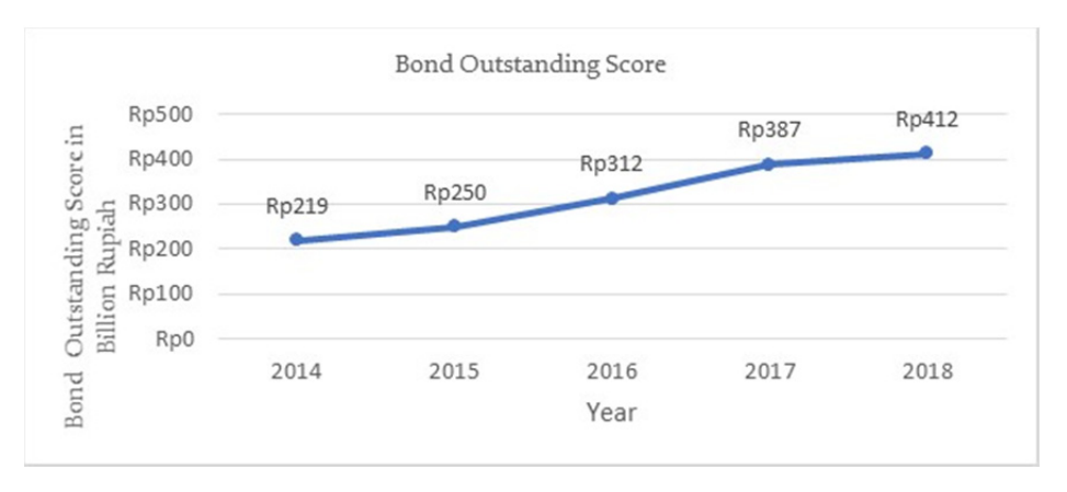
Figure 3. Development of conventional bond market in Indonesia

As for the bond market, the movement in the value of outstanding bonds for five years has also experienced an increasing trend from year to year, it was recorded that at the end of 2018 the outstanding value of bonds was Rp. 412 billion, which has increased significantly since 2014 with an increase of 47%.