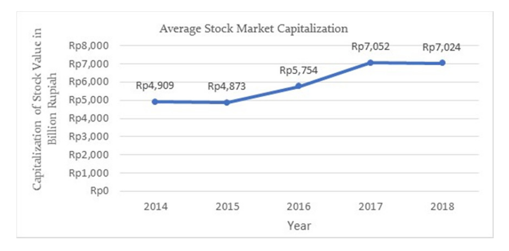
Figure 4. Development of the stock market in Indonesia

The number of investment alternatives offered in both the financial and capital markets can more or less influence investors' interest in investing in the stock market, resulting in a decline in the value of stock capitalization throughout 2018. The data of the dependent variable and independent variable in this research can be described descriptively as follows: