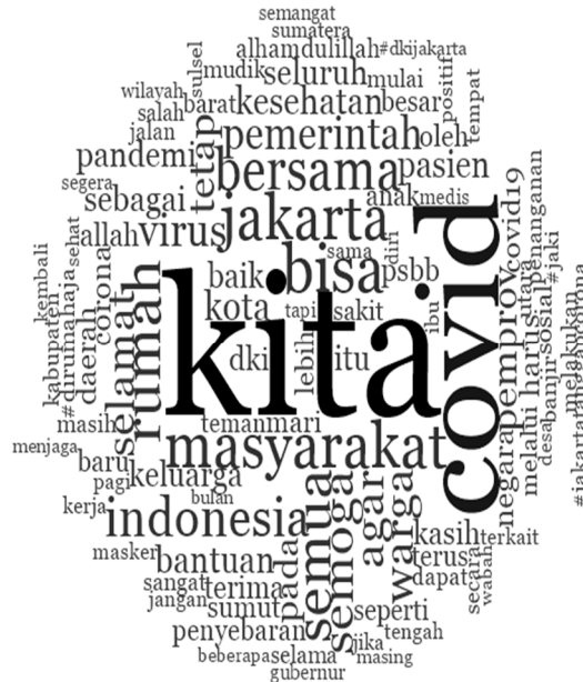
Figure 2. Discussion Issues in Communication and Coordination of President Jokowi, the Governor and the Covid-19 Task Force

Figure 2 shows the Chief of Staff's efforts to strengthen the country's togetherness during the disease outbreak. The words "KITA" and "COVID" were the most frequent expressions communicated to the Governors and Tasks officers to convey the nature of the viral disease as "a national problem solely resolvable through intensive collaboration among all levels of government." These statements also expressed crisis management efforts aimed at enhancing relevant stakeholders' confidence in the government as representatives of the peoples' interests. Also, cooperation was promoted as a relevant action, particularly in a multisectoral crisis as the outbreak. The recurrent word "KITA", meant all parties cooperated for national benefit, while relinquishing sectoral egos resulting from obstacles to the effectiveness of disaster management. These hindrances were products of political or economic motives subsequently degenerating into obstacles to the disaster management efficiency in Indonesia.