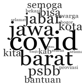
Figure 6: West Java Governor's attention to Covid-19 coordination and communication.

“Teman” was used an expression towards the community's contribution. This was also selected due to the symbolism of greater familiarity, distance and millennial impression.