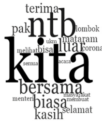
Figure 11: The NTB Governor's Attention to Covid-19 communication and coordination