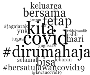
Figure 4. Attention of the Task Force in Communication and Covidence Handling Covid 19

aspect of behavior, according to established health protocols. Jokowi, as the highest holder of power in government, and also the main person in charge of handling the pandemic, ought to convey several explanations regarding the policies for proper management to be implemented. This is performed as a form of government's seriousness.