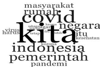
Figure 3. President Jokowi's Attention in Communication and Covidence Handling Covid 19

Jokowi (30%) performed a similar study, and explained the economic and social impacts incurred as a result of Covid-19. Furthermore, several coping strategies were observed to have been implemented. The we can do campaigns (11.8%) organized in Central Java to fight Covid-19 (11.4) was aimed at arousing the optimism of Central Java indigenes in the combat against the virus amid existing limitations. The transmission chain, for example, is possibly suppressed by the individual's willingness to stay at home or strictly implement health protocols in life. In addition, a similar pattern was observed by the Covid-RI Group (8.7%). Meanwhile, North Sumatra (26.85%) and NTB (7.61) focused on "We Are Together" as an important handling instrument to convey the message on cooperation, help and sacrifice of all parties. The South Sulawesi region emphasized on viruses (30.77%) to explain the dangers of Corona as a virus and measures appropriated by the government to overcome.