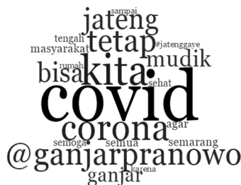
Figure 7: Central Java Governor's attention to Covid-19 coordination and communication.

West Java is one of the five Indonesian regions with the most covid-19 cases. Figure 5 shows the governor's twitter account (@Ridwan Kamil) is used to convey basic information about the disease's transmission as well as preventive measures and the province's name is often mentioned in this communication. This is because the disease's management is the provincial taskforce chairman's duty. Furthermore, this platform is used to elucidate response, rationalization and development programs. The words "Javanese" and "western" appear even more frequently than West Java, but are already implied by the region's name, and therefore, not counted. The other keyword is "PSBB", a policy created to stop Covid-19's spread in the district. This program's effectiveness depends on the authorities' socialization. Through this social media platform, awareness is increased in a bid to flatten the pandemic's curve.