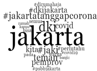
Figure 5. The Attention of the Governor of DKI in Communication and Covidence Handling Covid 19

Figure 4 shows the three main concerns of the Indonesian Task Force in handling the pandemic, including “Covid, Kita, and #dirumahaja”. This institution formed Indonesian government facilitated the coordination of activities between institutions, in an effort to prevent and mitigate the disease impacts new in Indonesia. Therefore, the massive socialization of related information was performed very naturally, as observed with the availability of detailed information about Covid, and how to break the distribution chain. Furthermore, the Indonesian Task Force, in line with Jokowi, also explained all of us (government and society) as the main key to proper management. This is effectively conducted by staying and performing activities at home to inhibit spread, experienced mainly after direct contact in public spaces.