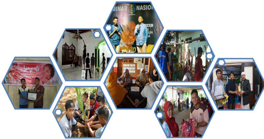
Figure 2: The activities of service-learning program in SMAIT NH

Students engaged in Community Service activities alongside the community members with major impacts on the community, as shown in Figure 2.