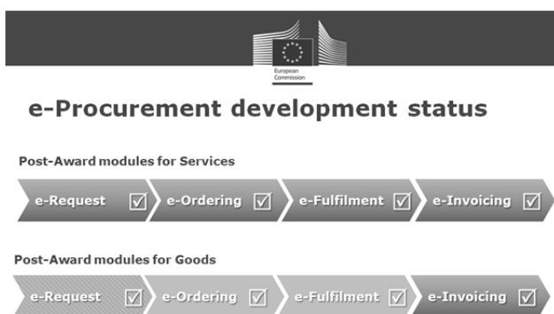
Figure 3. European Commission E-Procurement development status (Slide Player, 2014)

The latest results of the relevant research state that there is a direct relationship between the states' effectiveness against procurement corruption and the managerial tendency to expand the use of e-government. Towards this direction, decision makers should popularize electronic signatures, which is a prerequisite for secure e-procurement. Therefore, the funding offered by the European Union to implement this technology is being increased, monitoring almost all the way of procurement logistics and financial chains, as for example it is depicted in the flowchart below (Fig. 3). Furthermore, special bonuses or benefits could be awarded to private sector official or business operators using Information and Communication Technologies during their interaction with the governments. The increased traceability of transactions in the client-administration relationship results in reduced corruption as well as in enhanced productivity (Szopinski et al. 2017).